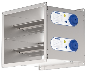
Unit with two controllers