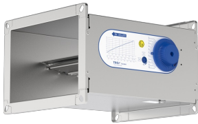
CAV CONTROLLERS TYPE EN-EX