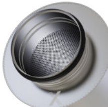
Spigot with lip seal