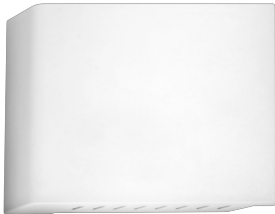
AIR QUALITY SENSOR