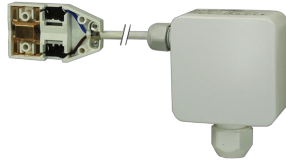
DEW POINT MONITOR