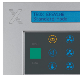
DISPLAY, FUNCTION BUTTONS WITH STATUS DISPLAY