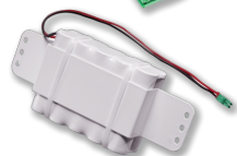
EXPANSION MODULE EM- TRF-USV