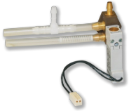
EXPANSION MODULE EM- AUTOZERO