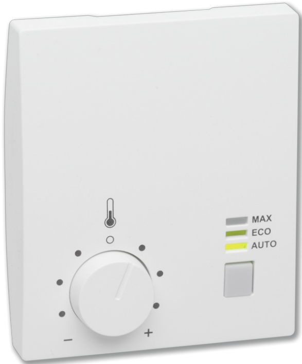
Room temperature controller CR24-B2