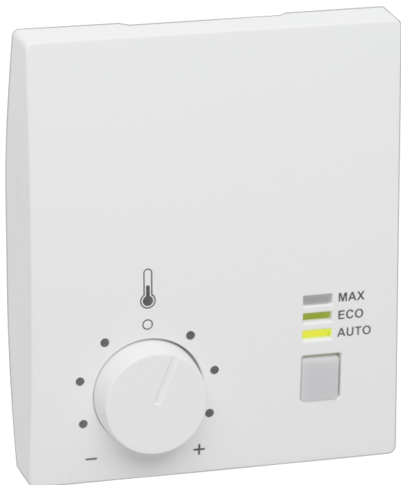
Room temperature controller ETN-24-VAV-227-P