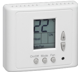
ROOM TEMPERATURE CONTROLLER ETN-24- VAV-227-P

Room temperature controller type ALT24/SUPER