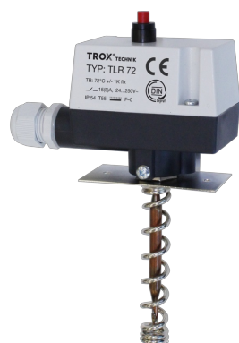
CAPILLARY TUBE SENSOR