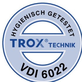
TESTED TO VDI 6022