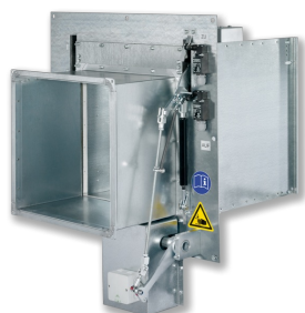
KA-EU WITH ELECTRIC BLADE OPENING ACTUATOR