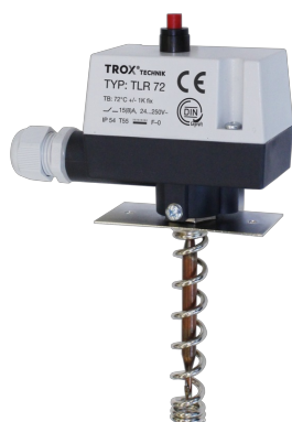
CAPILLARY TUBE SENSOR