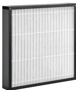
Z-LINE FILTER, CONSTRUCTION PLA