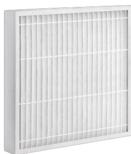
Z-LINE FILTER, CONSTRUCTION NWO