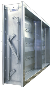
TUNNEL DAMPER WITH LINKAGE AND OPPOSED ACTION BLADES