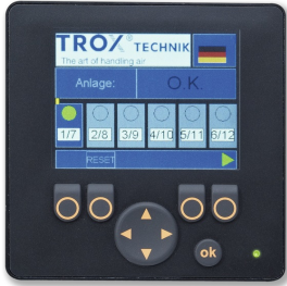
TNC-EC-AZM DISPLAY MODULE