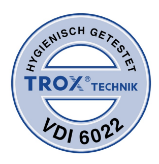
TESTED TO VDI 6022