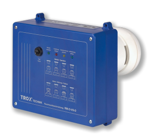
DUCT SMOKE DETECTOR RM-O-VS-D