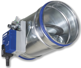
SHUT-OFF DAMPER, VARIANT AK, WITH ACTUATOR