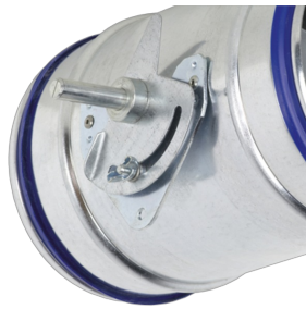
VARIANT FOR MANUAL OPERATION