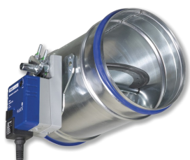
SHUT-OFF DAMPER, VARIANT AK, WITH ACTUATOR