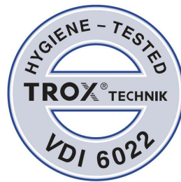
TESTED TO VDI 6022