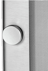
KNURLED SCREW FOR TOOL-FREE FASTENING