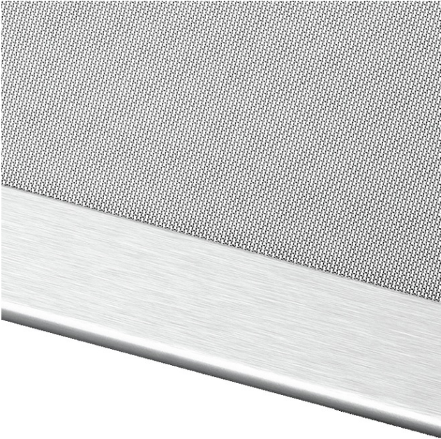
Knurled screw for tool-free fastening