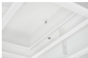
Pressure measurement point, detail