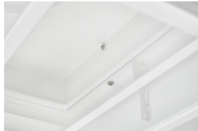
Pressure measurement point, detail