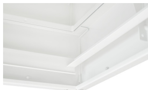
Test groove, detail