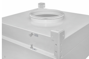
Circular spigot with lip seal