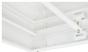
Internal measuring tube to sample particles for measurement