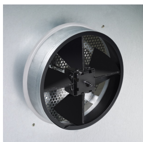
SPIGOT WITH DAMPER BLADE