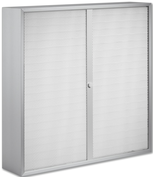
FHD - Construction with centre mullion