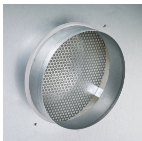
SPIGOT WITH FIXED BAFFLE PLATE