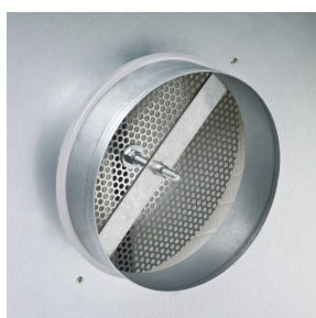
SPIGOT WITH ADJUSTABLE BAFFLE PLATE