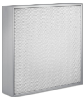
FHD &#X2013; CONSTRUCTION WITHOUT CENTRE MULLION