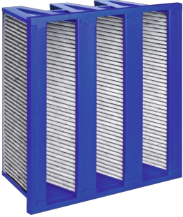
ACTIVATED CARBON FILTER INSERT, TYPE ACFI