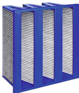
ACTIVATED CARBON FILTER INSERT, TYPE ACFI