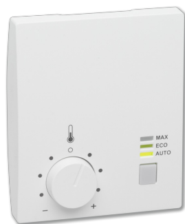
ROOM TEMPERATURE CONTROLLER TYPE CR24-B1