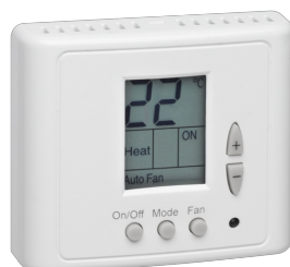
ROOM TEMPERATURE CONTROLLER ETN-24- VAV-227-P

Room temperature controller type ALT24/SUPER