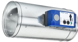
VAV terminal unit type TVE with an Easy controller

VAV terminal unit type TVR with an Easy controller