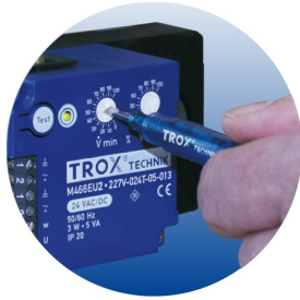
Set flow rates