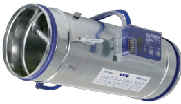
VAV TERMINAL UNIT TYPE TVR/160/EASY

VAV terminal unit type TVR with an Easy controller