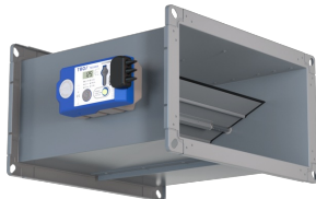
VAV CONTROL UNIT VARIANT TVE-Q-P1 (POWDER-COATED)