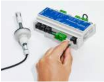
Plug-and-play connection of components